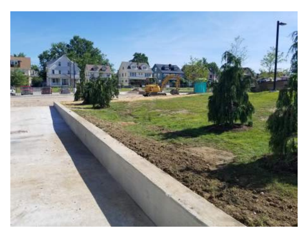
Site Landscaping Installation