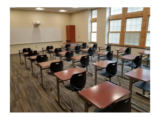
Furniture Installation in Area F 2nd & 3rd Floors