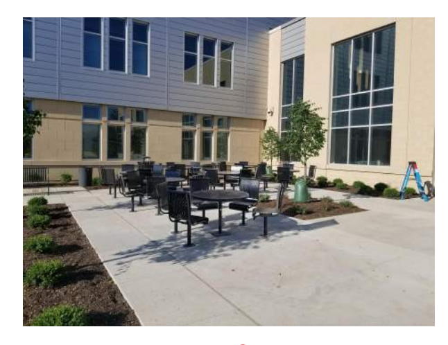
Furniture in the Outdoor Plaza