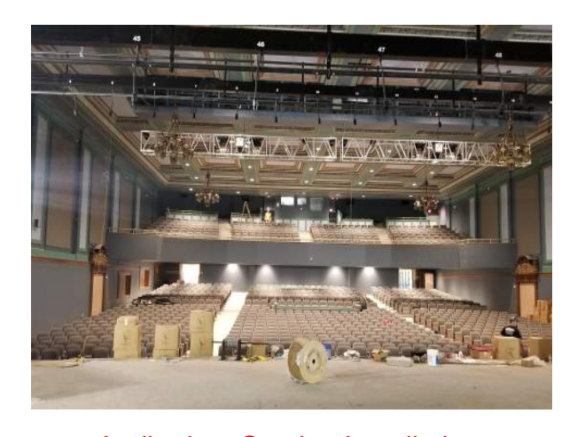
Auditorium Seating Installation