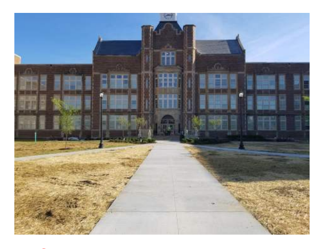
Courtyard Exterior Door Installation